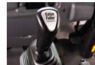
TRANSMISI EATON ES 11109