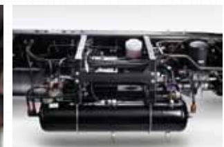
AOH BRAKE SYSTEM