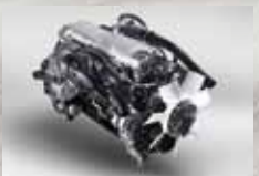
MESIN 6 HK1-TCS • 6 CYLINDER • 285PS • HEAVY DUTY COMMONRAIL