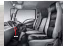
KABIN DILENGKAP LUTHER & JOK BARU YANG ELEGAN