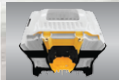
PENAMBAHAN ANTI KARAT PADA KABIN