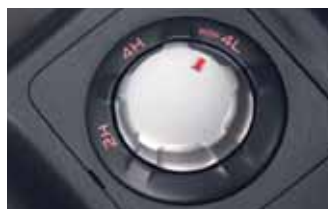
4WD Shift on The Fly System