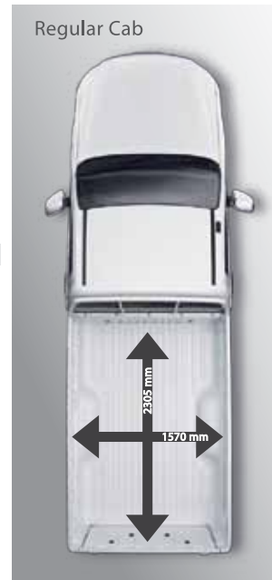
Large rear cargo area

* Untuk peningkatan mutu dan penyesuaian dengan perkembangan teknologi, spesifikasi dapat berubah sewaktu-waktu tanpa pemberitahuan terlebih dahulu.