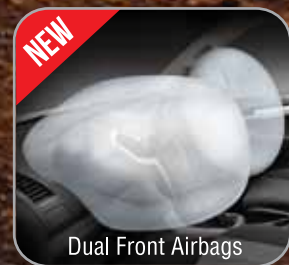
Dual Front Airbags