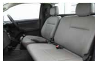
Split Bench Seat